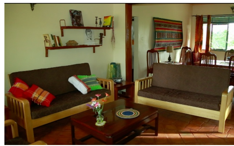
Our beautiful Guest House!